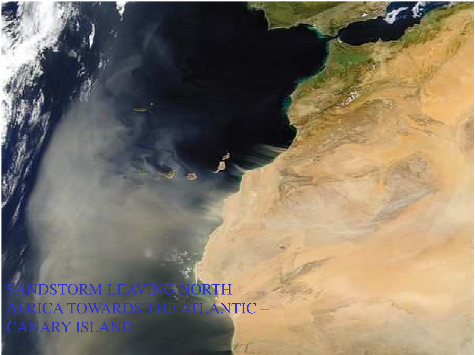
SANDSTORM LEAVING NORTH AFRICA TOWARDS THE ATLANTIC – CANARY ISLAND.